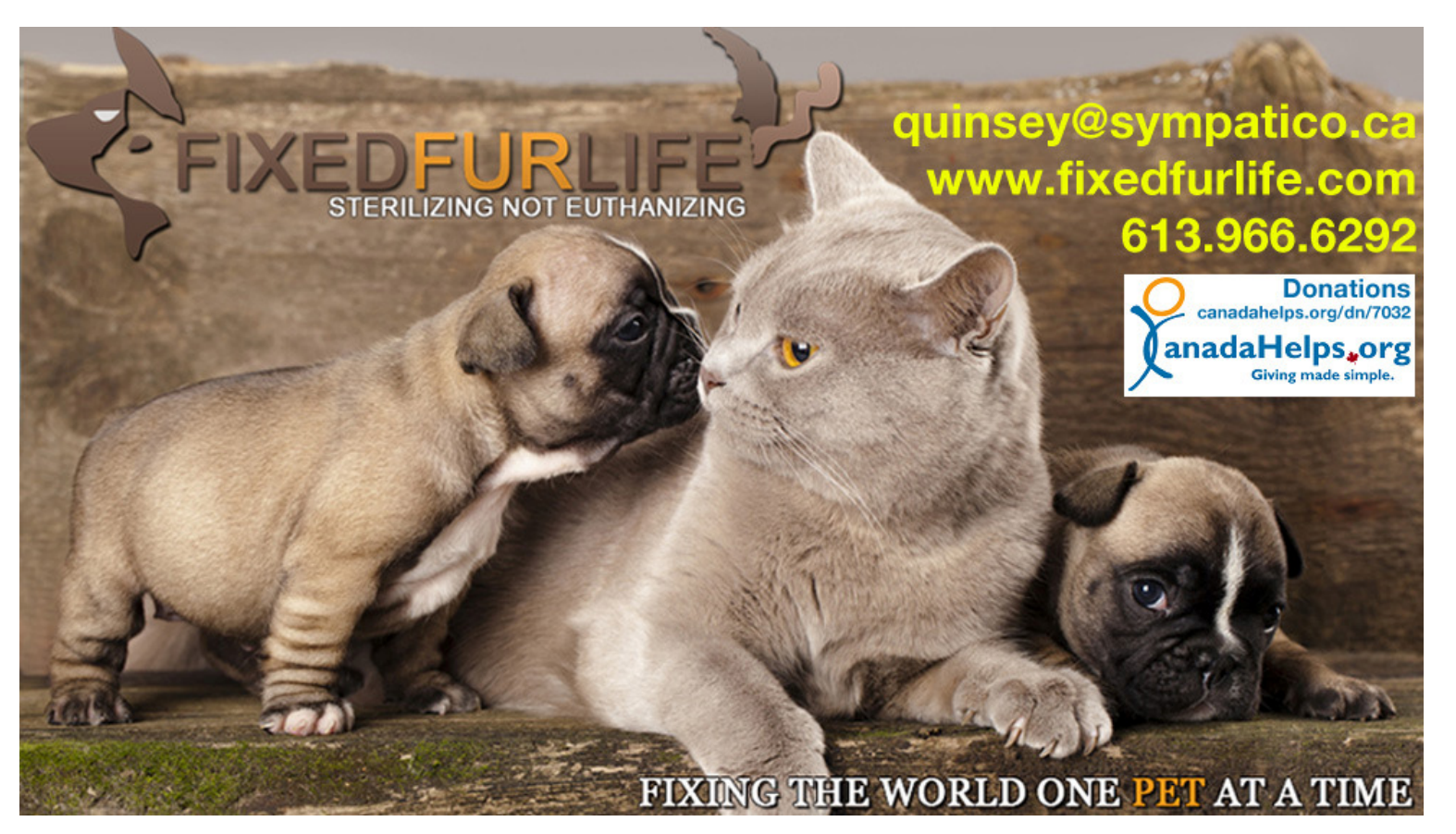
Fixed Fur life supplies the Kittens waiting to be adopted from Doggie Daycare.